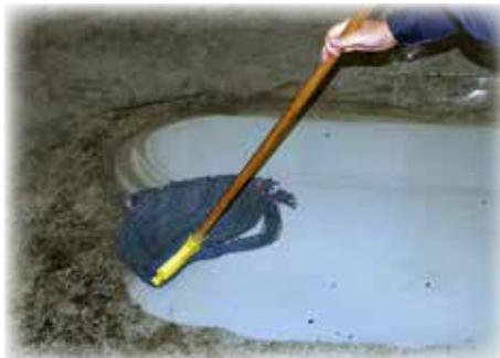
Mop, cloth or brush